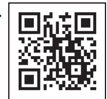
COVID-19 Vaccine Navi secondary code

COVID-19 Vaccine Navi website address: https://v-sys.mhlw.go.jp